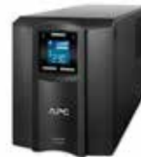
UPS & POWER SMART