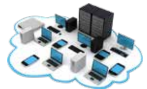
INSTALLATIONS & TECH SUPPORT