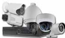
CCTV & SECURITY